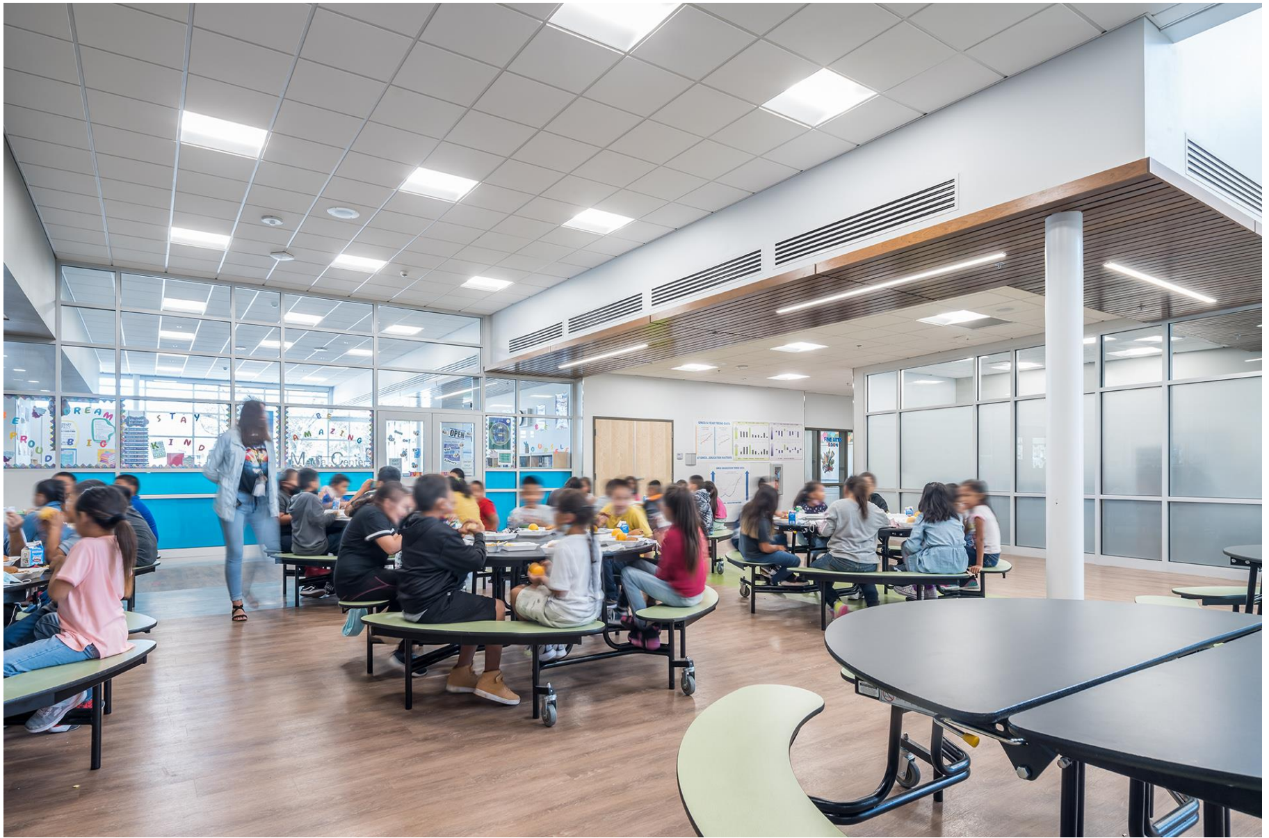
Gallup-McKinley – Thoreau ES – Dekker Perich Sabatini