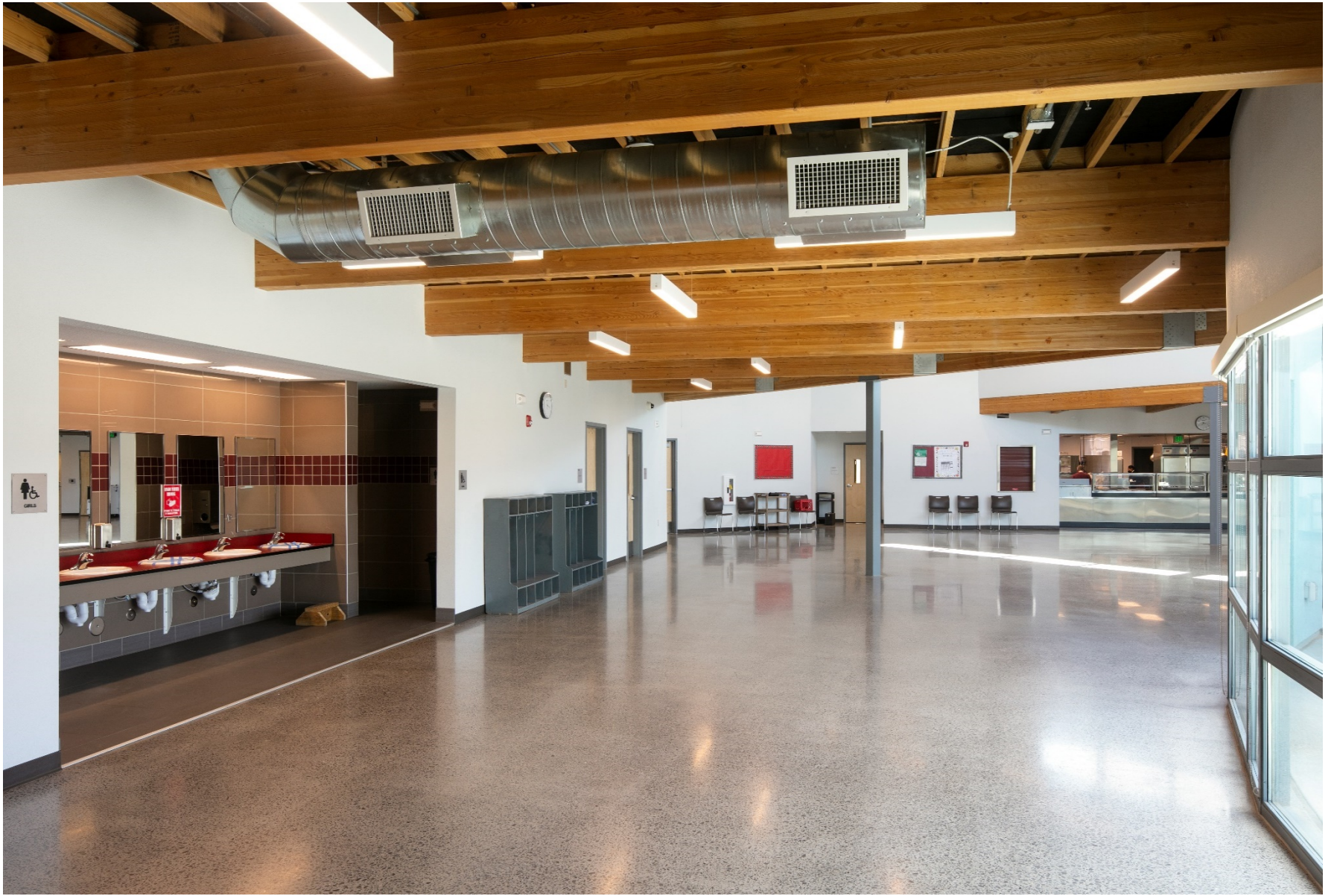
Belen - Rio Grande ES – NCA Architects