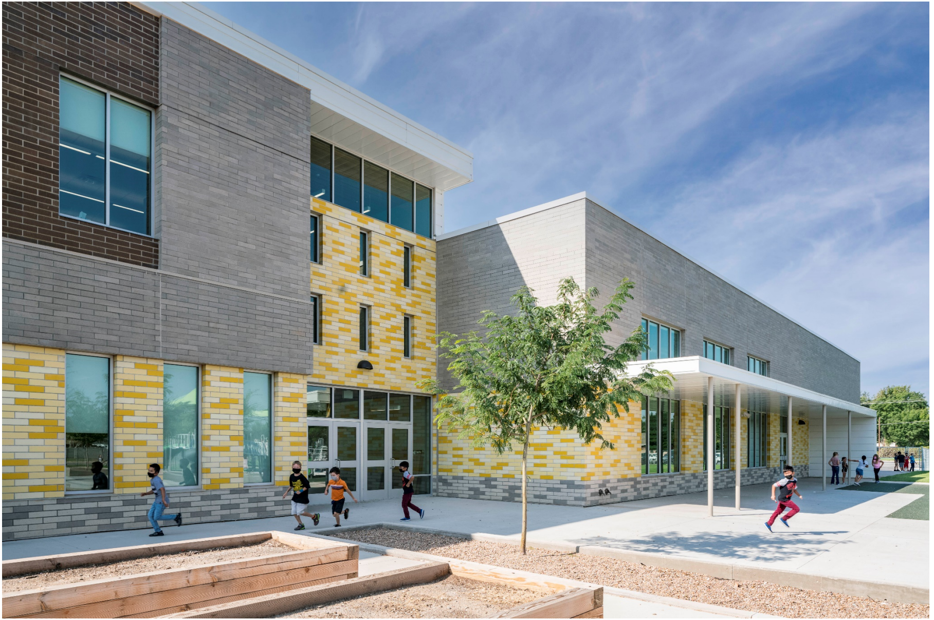
Roswell – Del Norte ES – SMPC Architects