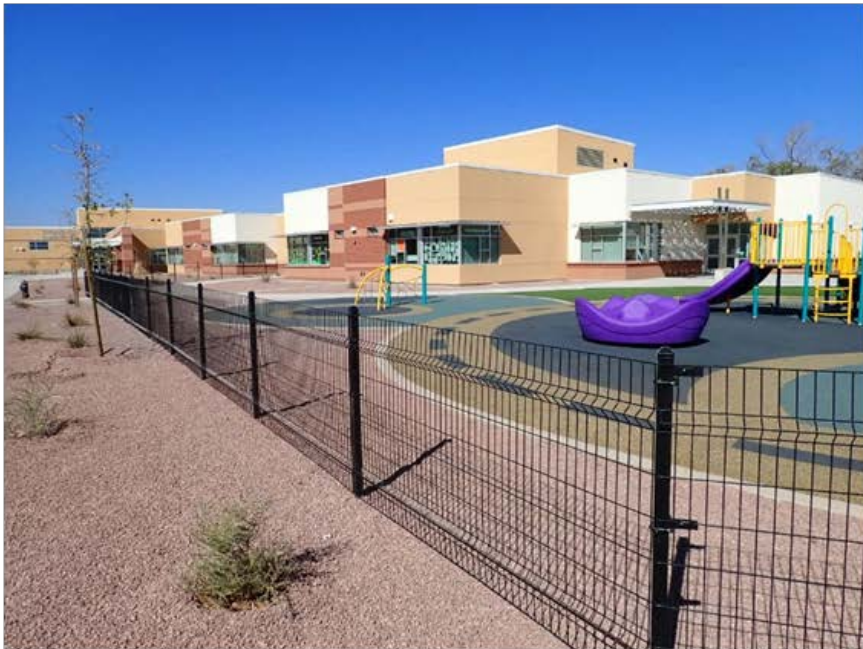
Gallup-McKinley – Thoreau ES – Standards-Based Project