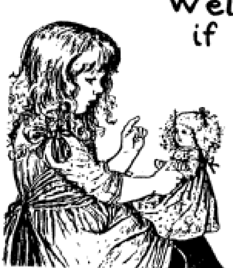
POT SMOTS No. 1702. *1980 Ashleigh Brilliant