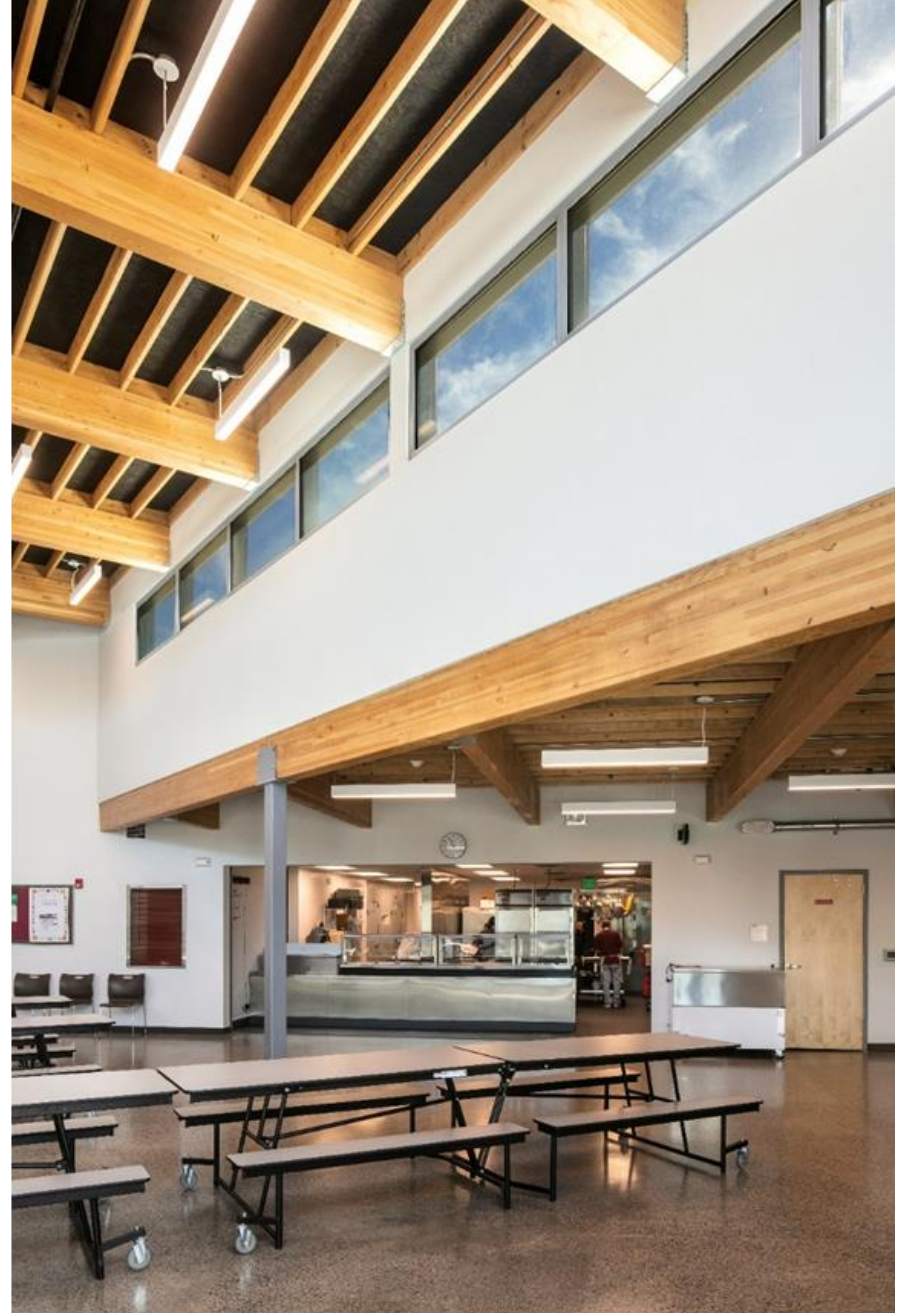
Belen - Rio Grande ES – Standards-Based Project Professional