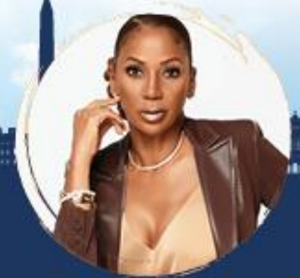
Holly Robinson Peete Actress, Author, Activist, and Philanthropist