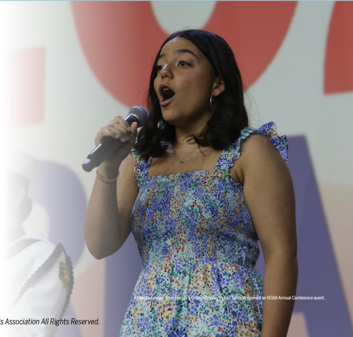
A talented singer from Florida's Orange County Public Schools opened an NSBA Annual Conference event.